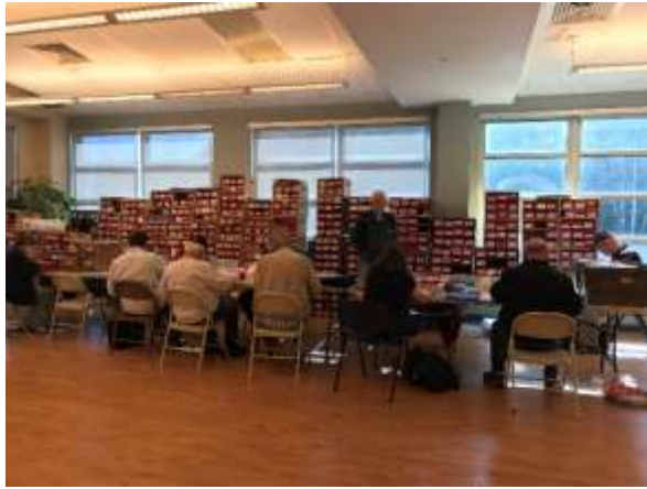
Busy dealer table